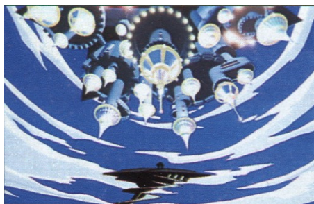
Rumors of strange things abound...